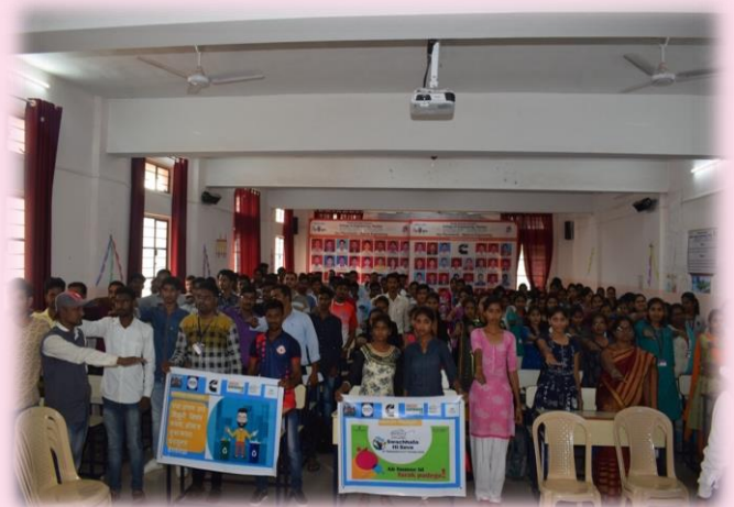
Student during taking Pledge on Swacchata