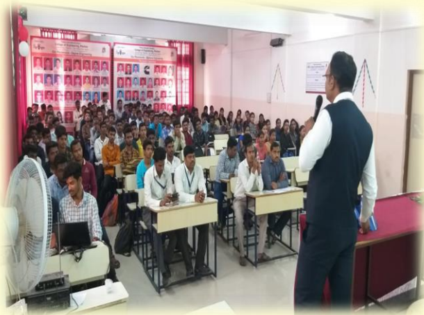
View of the audience during the Lecture