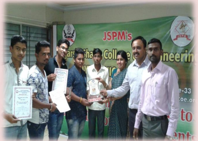
Carrom Winner Team getting Certificate from Guests

In Zonal level organized under MSBTE, students achieved Winner prizes in Freestyle Wrestling (Boys-70kg & 125kg), Carrom (Boys), Chess (Boys) and Runner-up in Volley ball (Boys), Table Tennis (Girls) & Carrom Girls. Student's participation also participated in Kho-Kho (Boys) & Kabaddi (Boys).