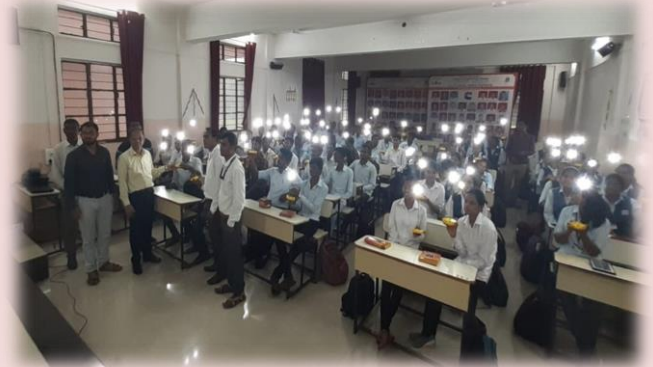
Students developed their own Solar Device and used it.