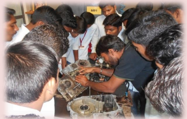
Kamal Bajaj Automotive Pvt. Ltd. Phaltan.