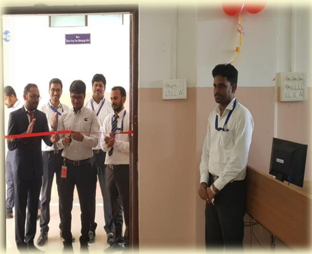
Inauguration of CAD WAR-2D event

The IEI Student Chapter of Department of Mechanical Engineering (Polytechnic) of PES's College of Engineering, Phaltan organized a technical event "CAD WAR – 2D Modeling" on 20th September 2019. It was great competition for students to draft the different objects by using AutoCAD software and they functioned individually and effectively to complete the task.