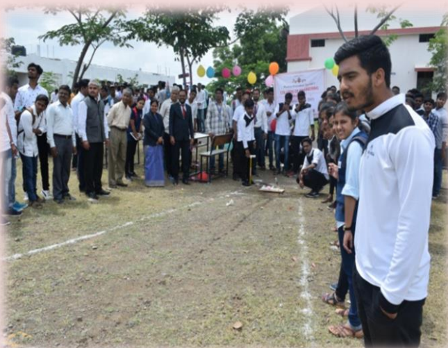
Water Rocket Launcher