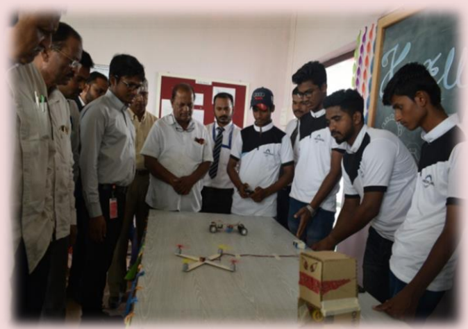
Mechanical Model Making