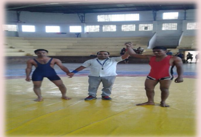
Umpire Declaring Winner of Wrestling