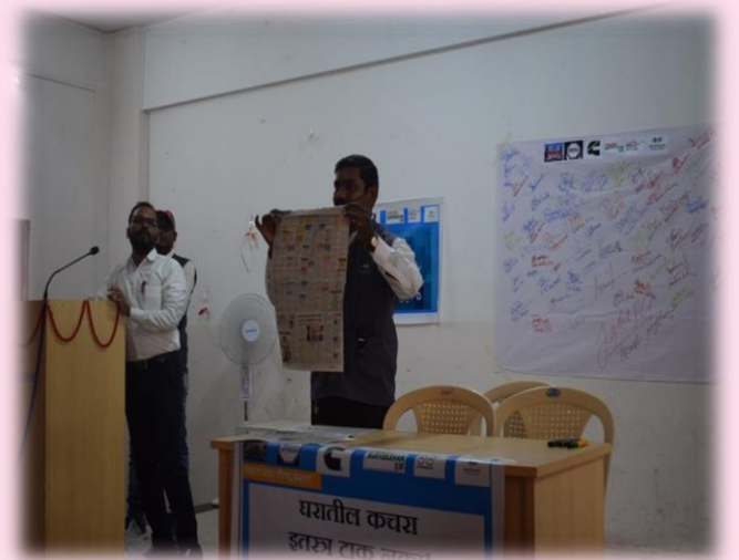
Resource persons showing paper bag demo