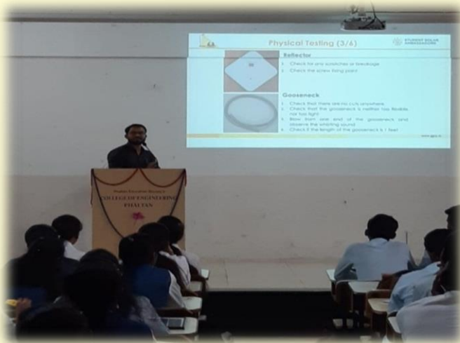
Trainer explaining content of the workshop

If the students, in their early age, learn to make their own solar device and use them, not only they will likely to be future users of solar energy but they will also be promoting its uses in their own generation and become student solar Ambassador.