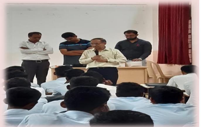
Hon' Principal Sir took feedback after completion of the workshop.