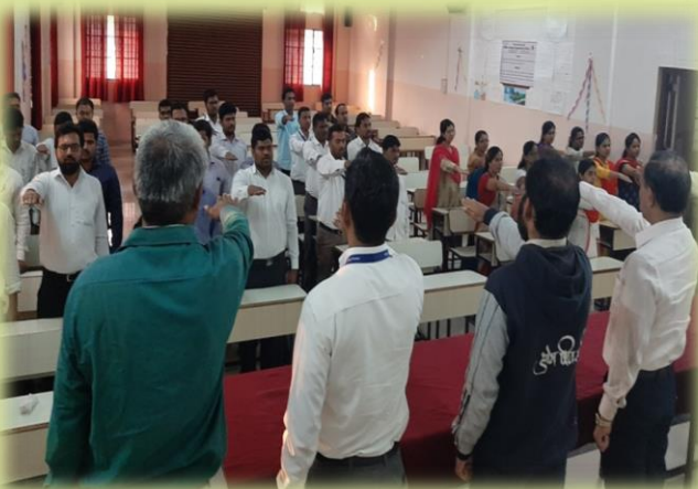
Group reading of Preamble of Indian Constitution