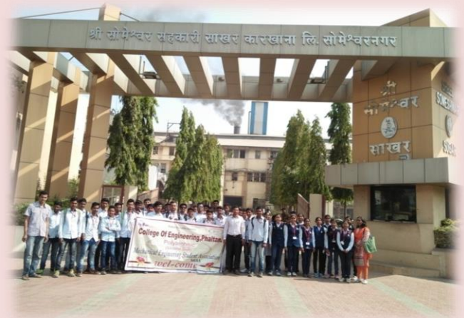
Students visited to Someshwar Sahakari Sakhar Karkhana, Someshwar.

Mechanical Department of College of Engineering, Phaltan (Diploma Second Shift) organized industrial visits for students to add value in their knowledge and to gain hands-on experience of how industry operations are executed. Our students visited to Someshwar Sahakari Sakhar Karkhana, Someshwar to understand the all thermal process related to boiler. Also students Visited to Kakade Laser Pvt. Ltd. Pune and Kamal Bajaj Automotive Pvt. Ltd. Phaltan as a part of curriculum.