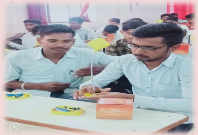
Students while assembling Parts of Solar Device